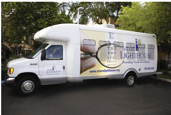
Figure 1 One of the Florida Heiken Children's Vision Program's mobile units.