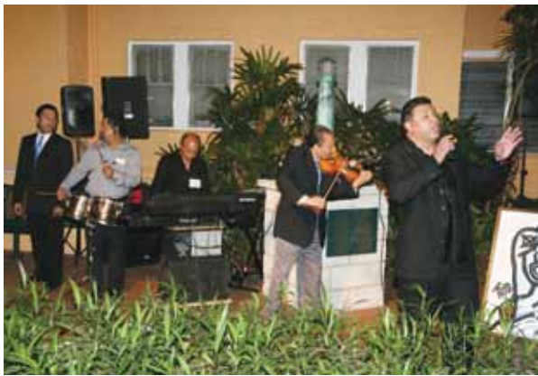
Musicians in the Miami Lighthouse Garden

The full press release about the Knight Foundation grant and a Channel 10 news clip about the Miami Lighthouse Henry and Inez Stone Music and Sound Studio can be viewed on our web site: www.miamilighthouse.org