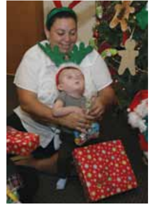
Our littlest clients were very fortunate to have two holiday parties in December. The Junior League of Miami hosted a party on our Blind Babies Play Day , and later a second party was held just for our blind babies and their parents. Special appreciation goes to the Dade County Bar Association for providing presents for both events.